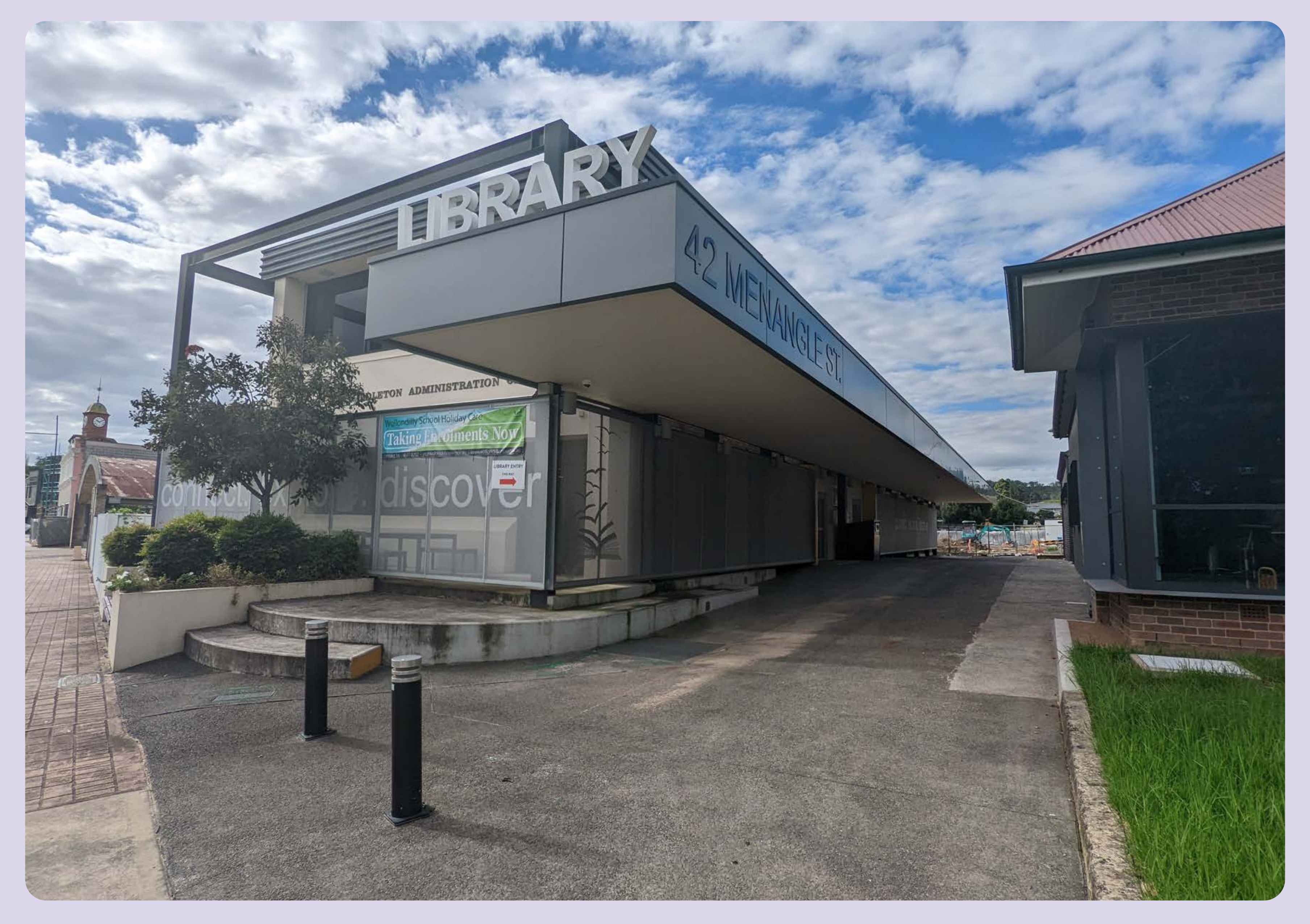
I am going to visit Wollondilly Library for Storytime.