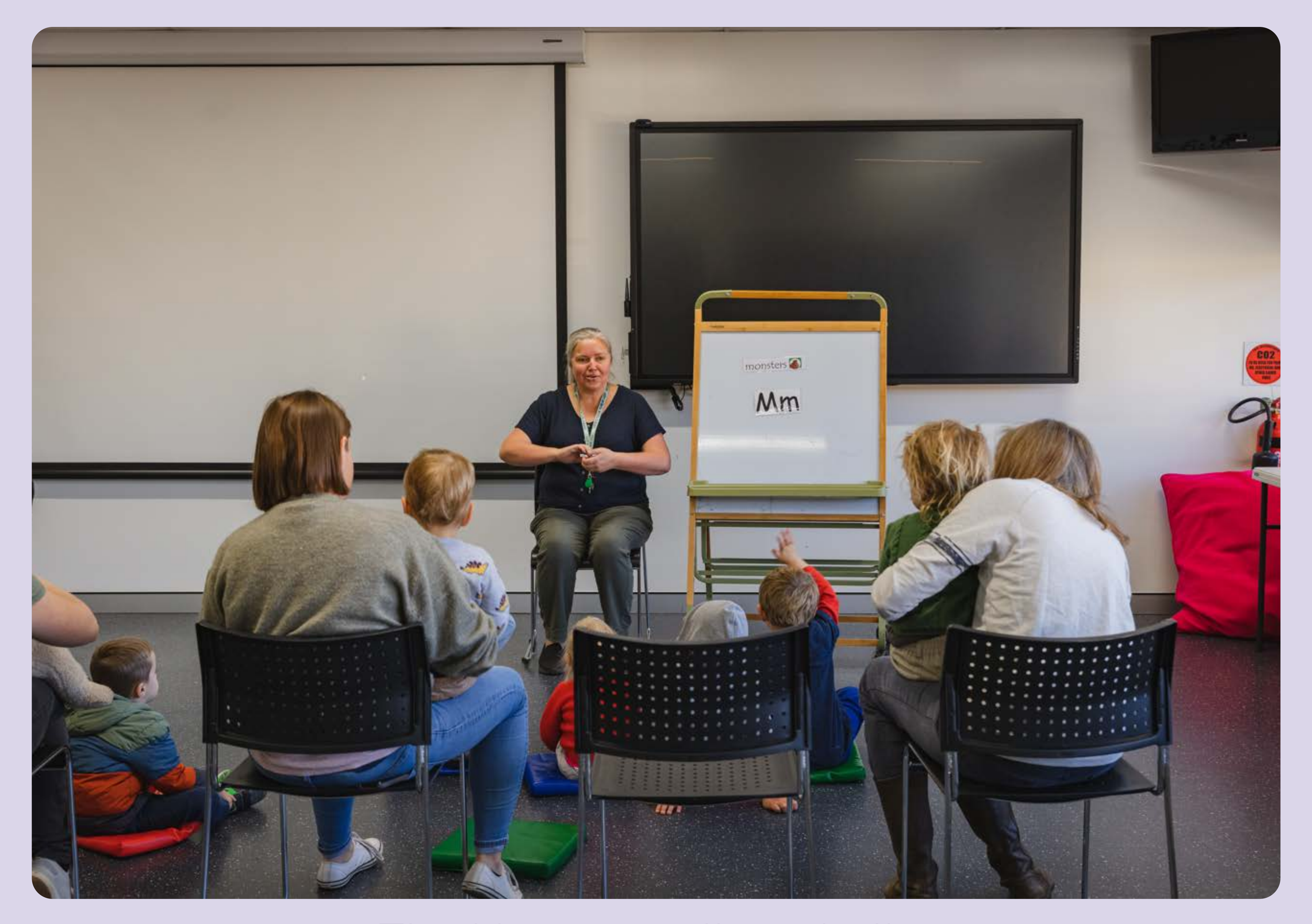
The librarian will say hello.

The librarian may read stories and sing songs.