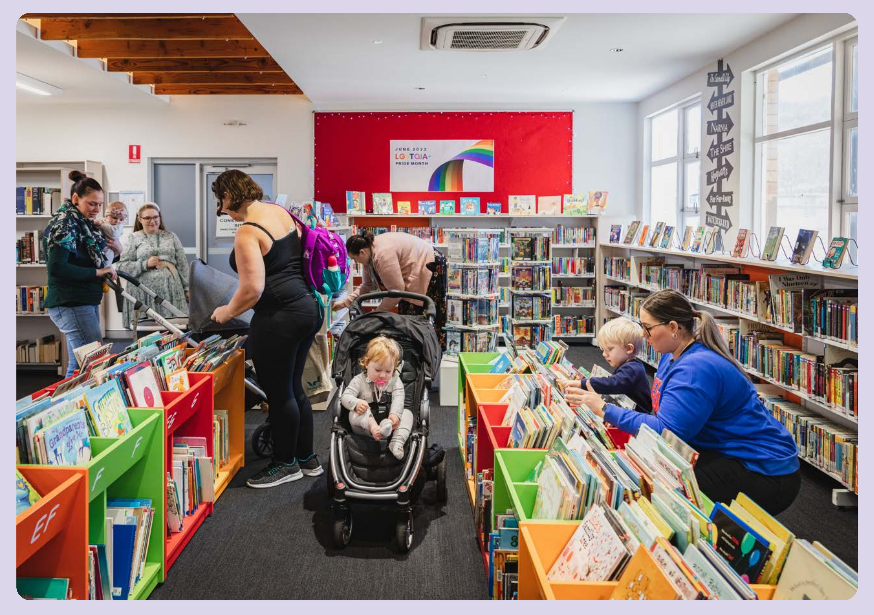
I may be able to go to the Children's Area after Storytime has finished.