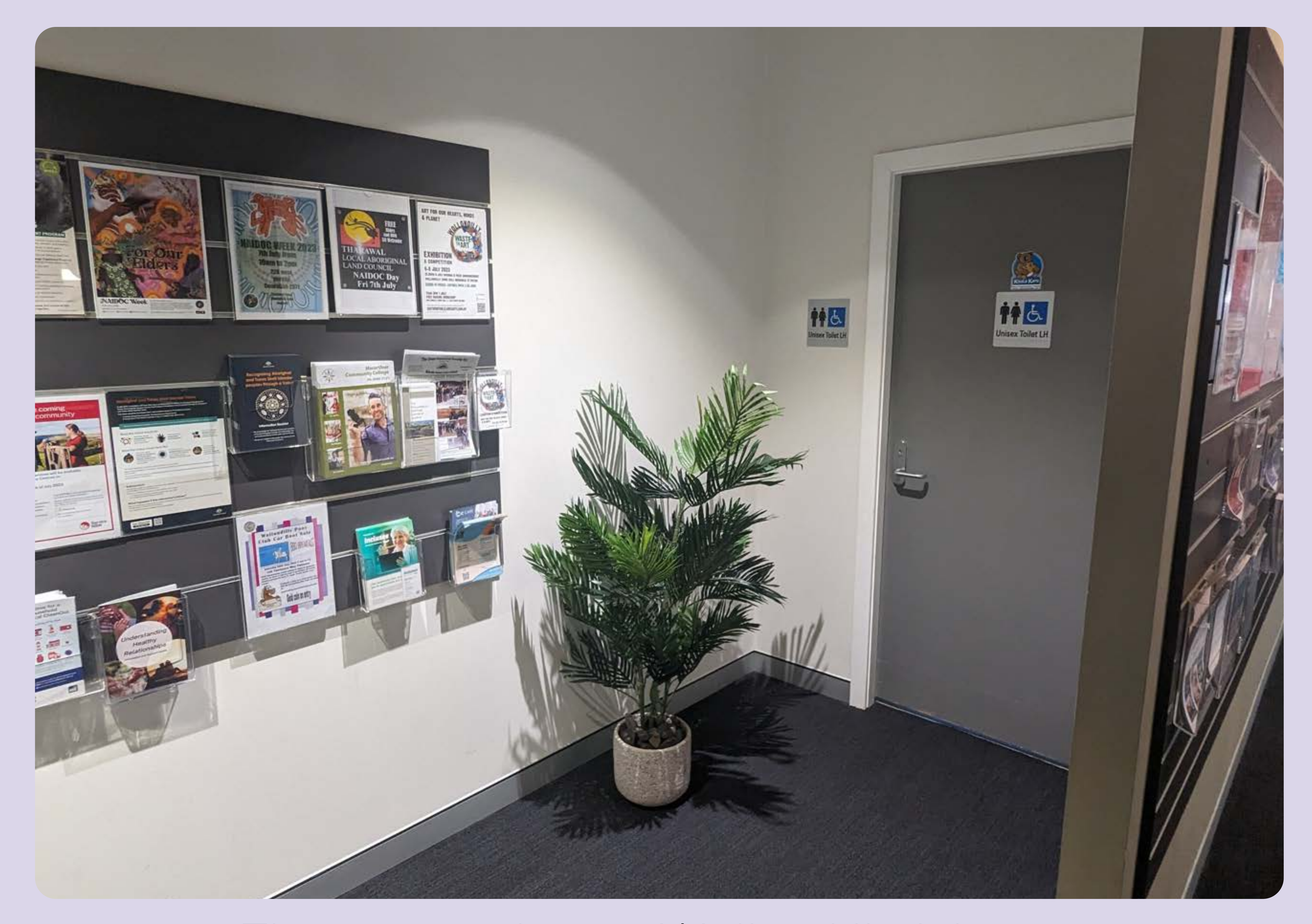
There are toilets at Wollondilly Library.

I will try to tell my trusted adult when I need to use the toilet.