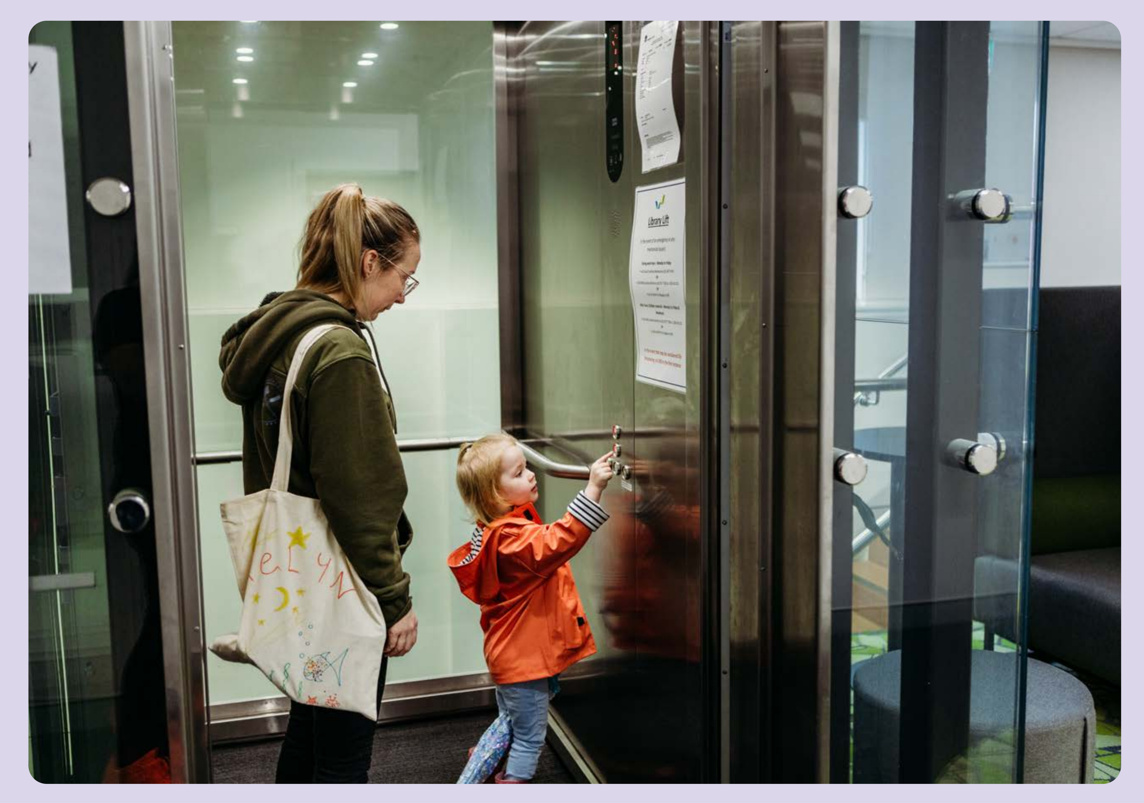
My trusted adult will take me upstairs to the Storytime area. We may take the elevator or the stairs.