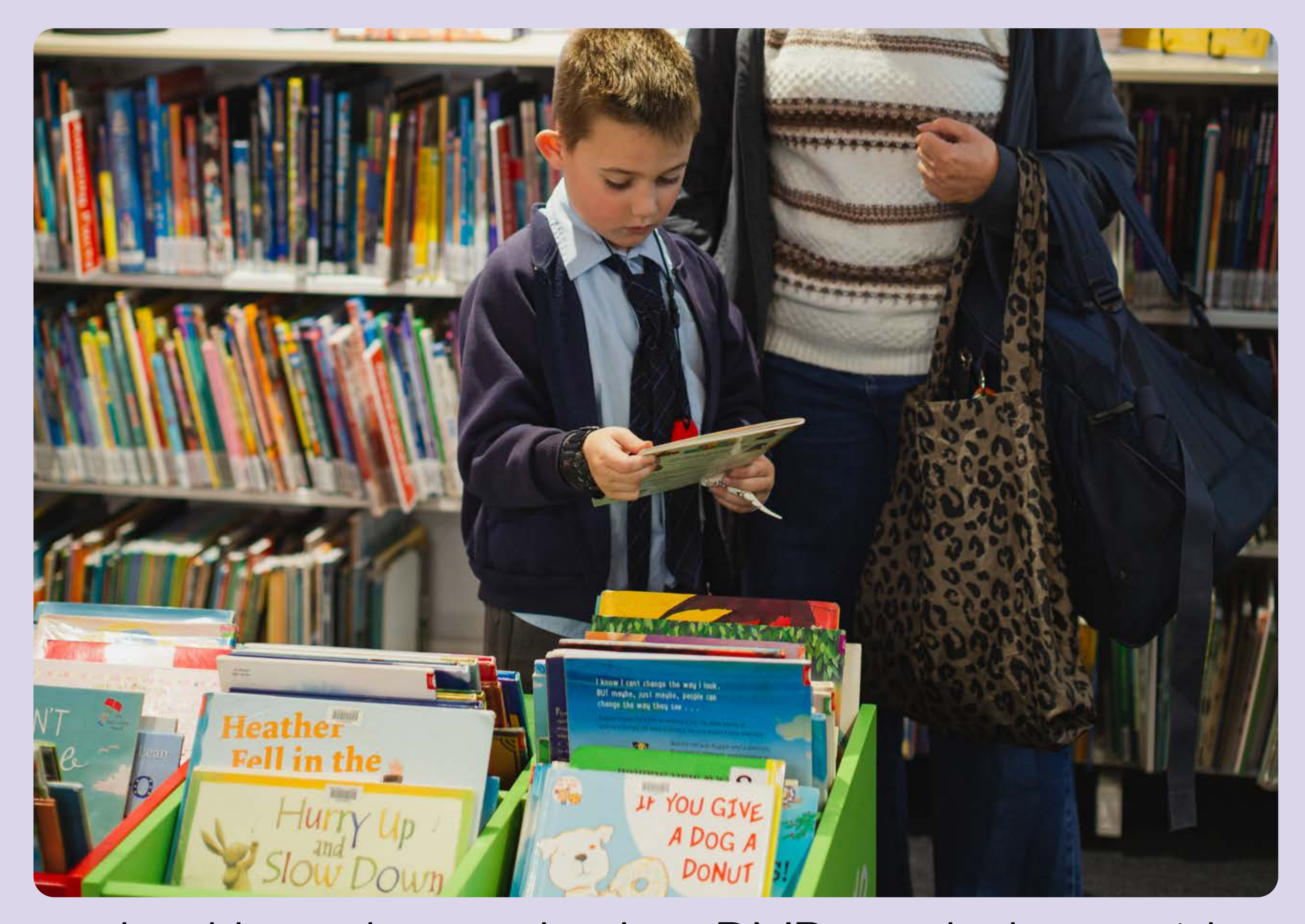
I may be able to choose a book or DVD to take home with me.