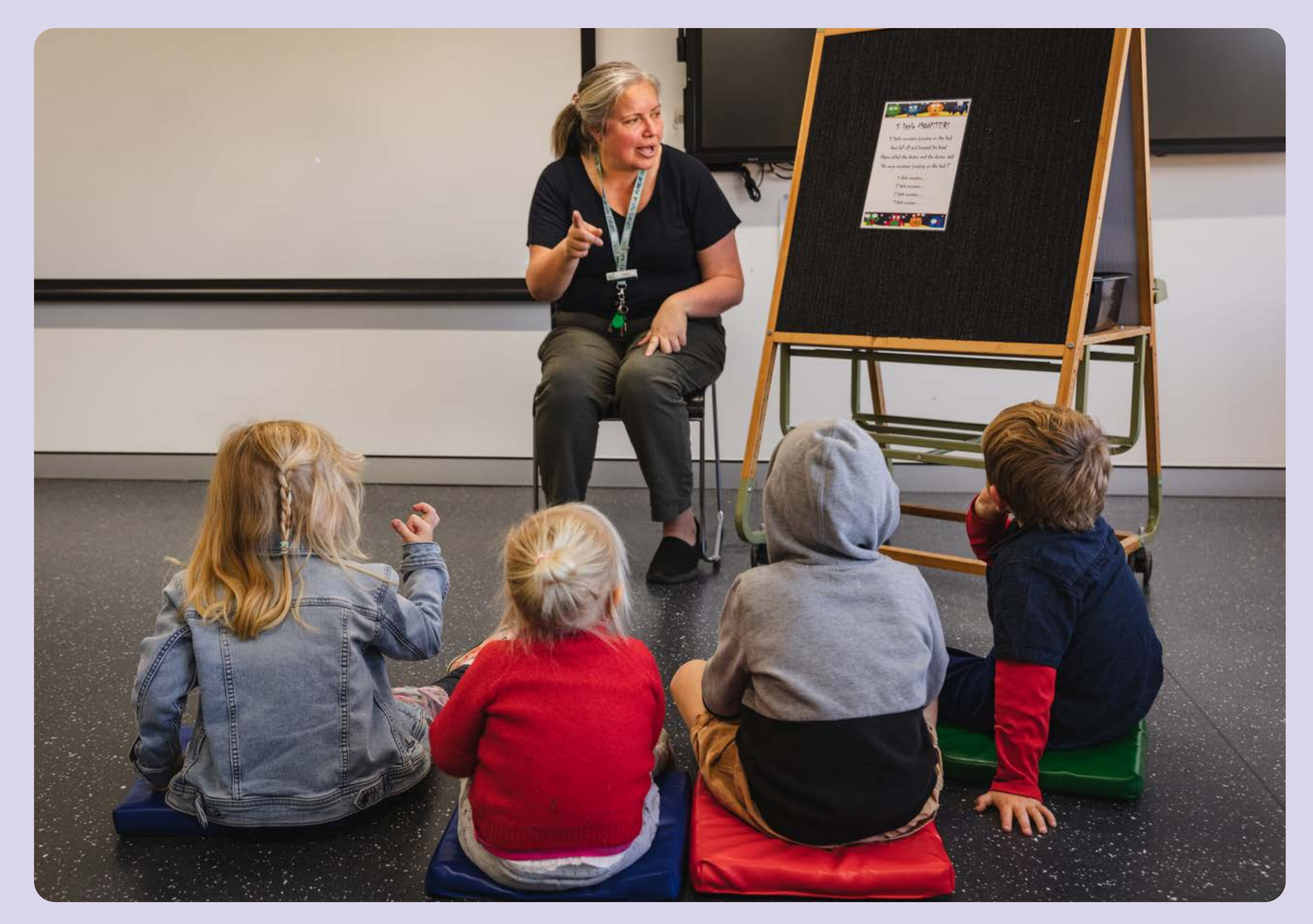
I may choose to sit on one of the cushions on the floor. I will try to sit quietly. My trusted adult can sit with me.