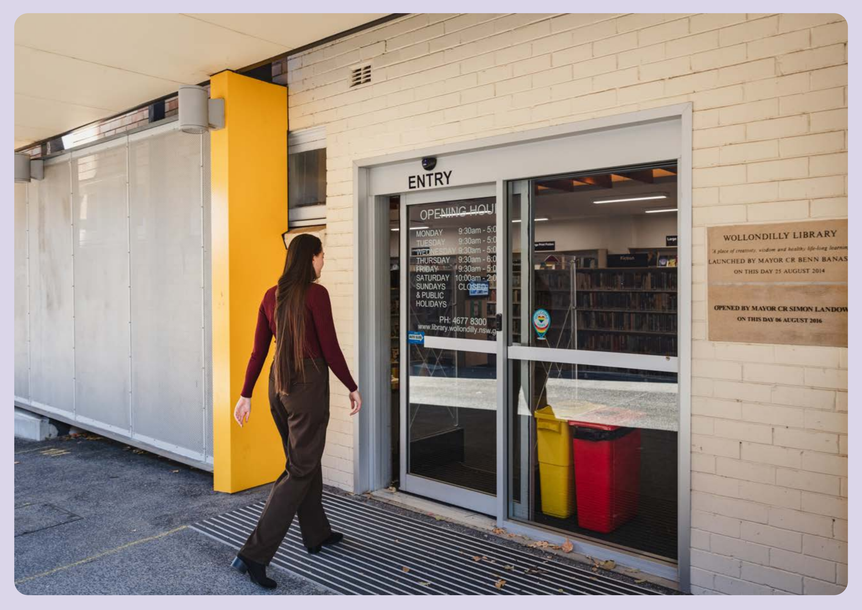
I will enter the Library through glass sliding doors.