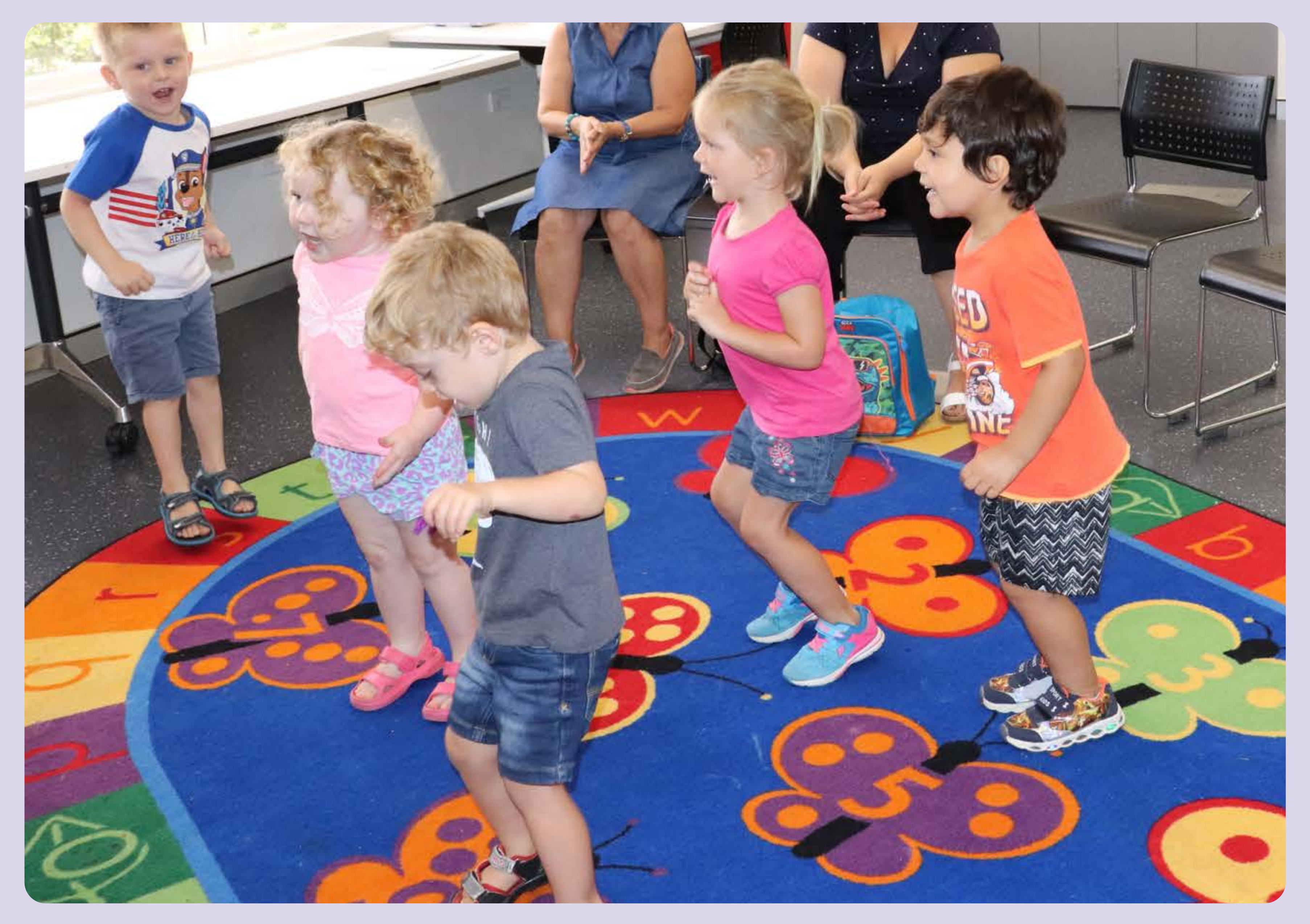
Other children may sing, dance or move during Storytime. I may want to sing, dance or move too.